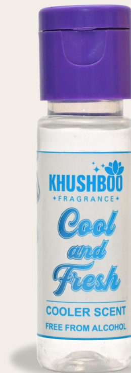
Cool and Fresh